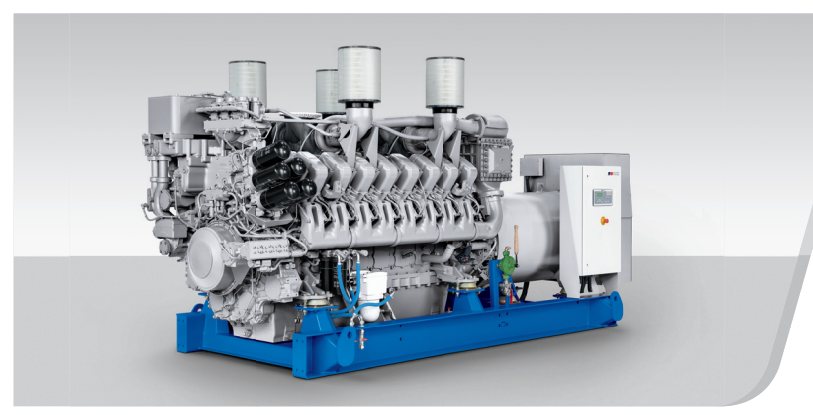
Optional equipment and finishing shown. Standard may vary.

380V – 11 kV/50 Hz/Standby/Fuel Consumption Optimized MTU 16V4000G63/Water Charge Air Cooling